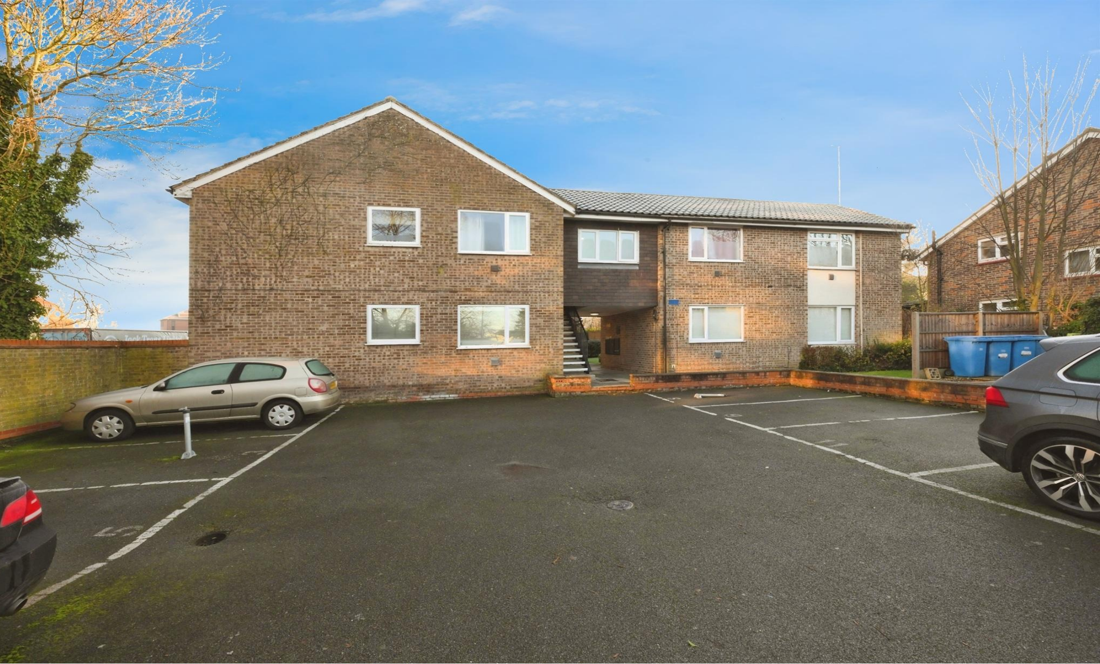
Crouch Court Rivermill ,Harlow CM20 1PP