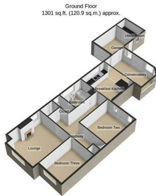
Ground Floor 1301 sq.ft. (120.9 sq.m.) approx.