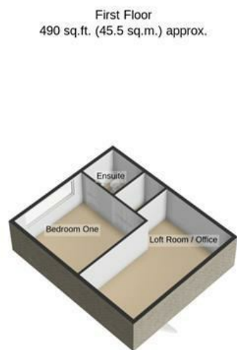
First Floor 490 sq.ft. (45.5 sq.m.) approx.

For illustrative purposes only. Decorative finishes, fixtures, fittings and furnishings do not represent the current state of the property. Measurements are approximate. Not to scale. Made with Metropix © 2026