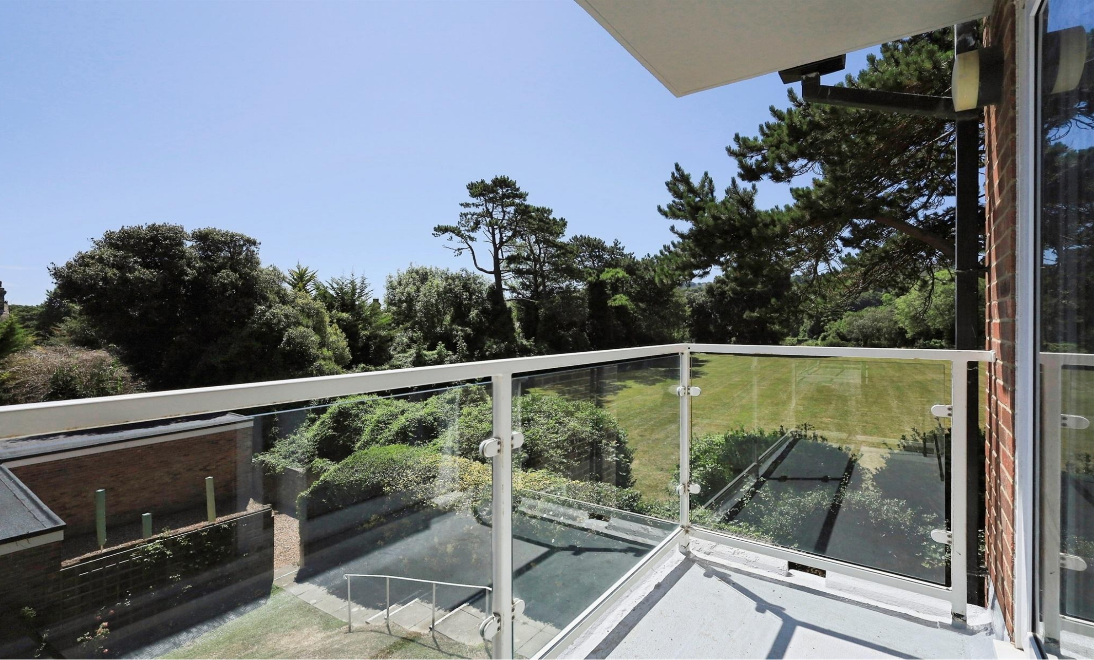
Como House Carlisle Road, Eastbourne BN20 7TD