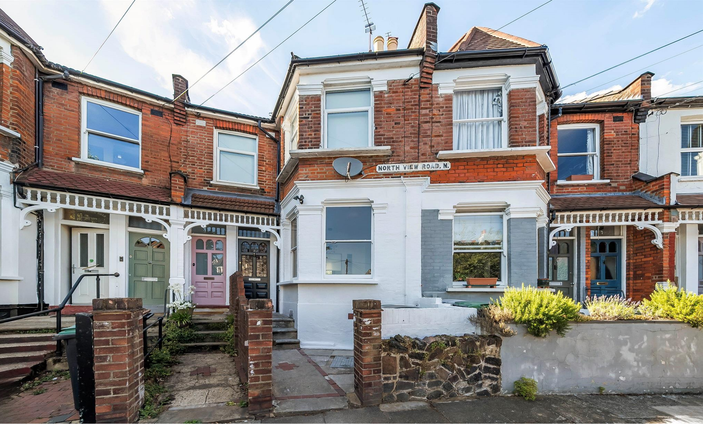
North View Road, London N8 7LP