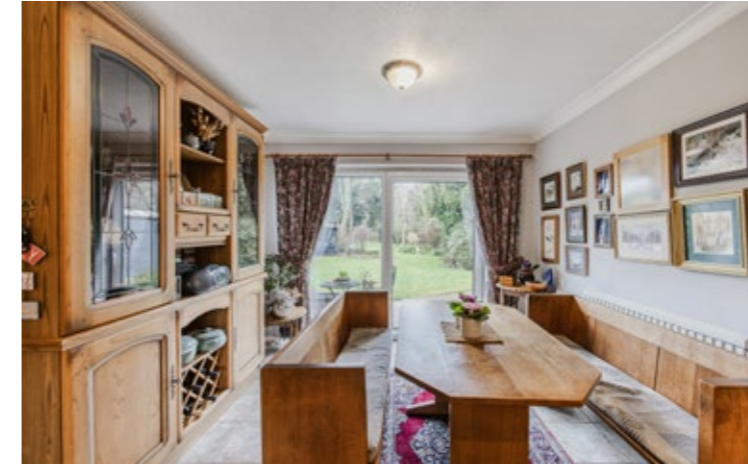
Dining End of Kitchen

“One of my favourite spots in the house is the dining area of the kitchen, which enjoys lovely views over the garden.”