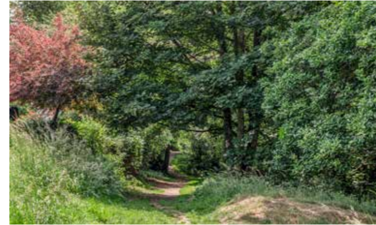
Path through Little Hills

“...the peaceful setting offers a sense of privacy that belies the proximity to town.”