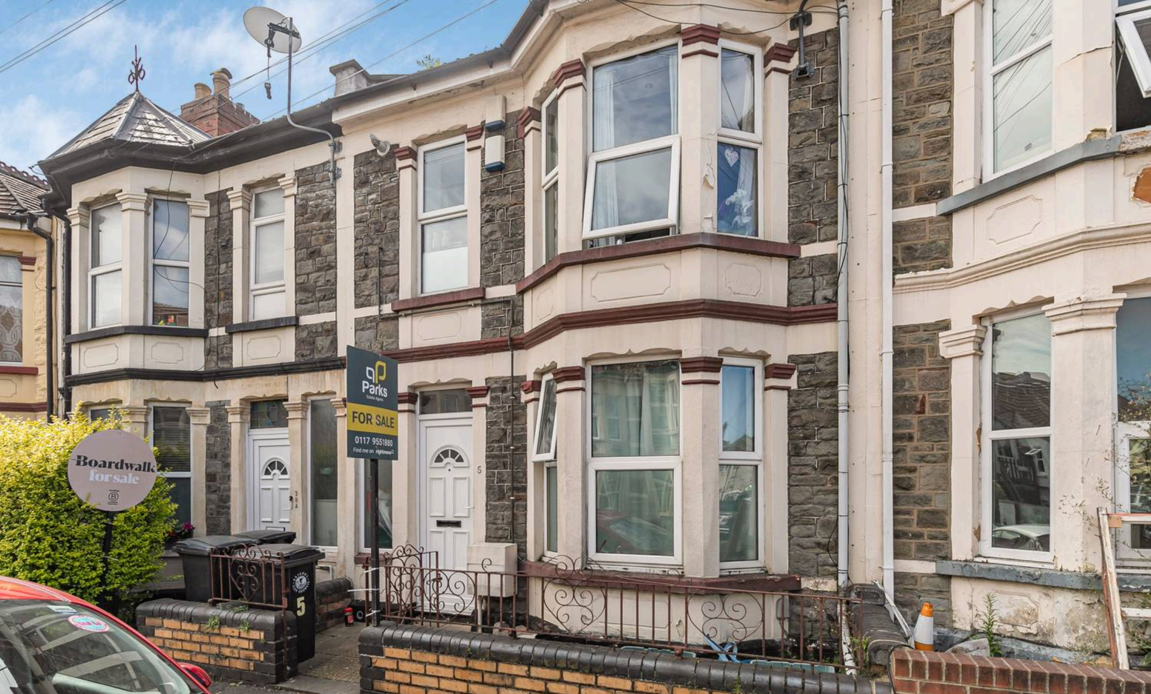
5b Westminster Road, Bristol £176,400