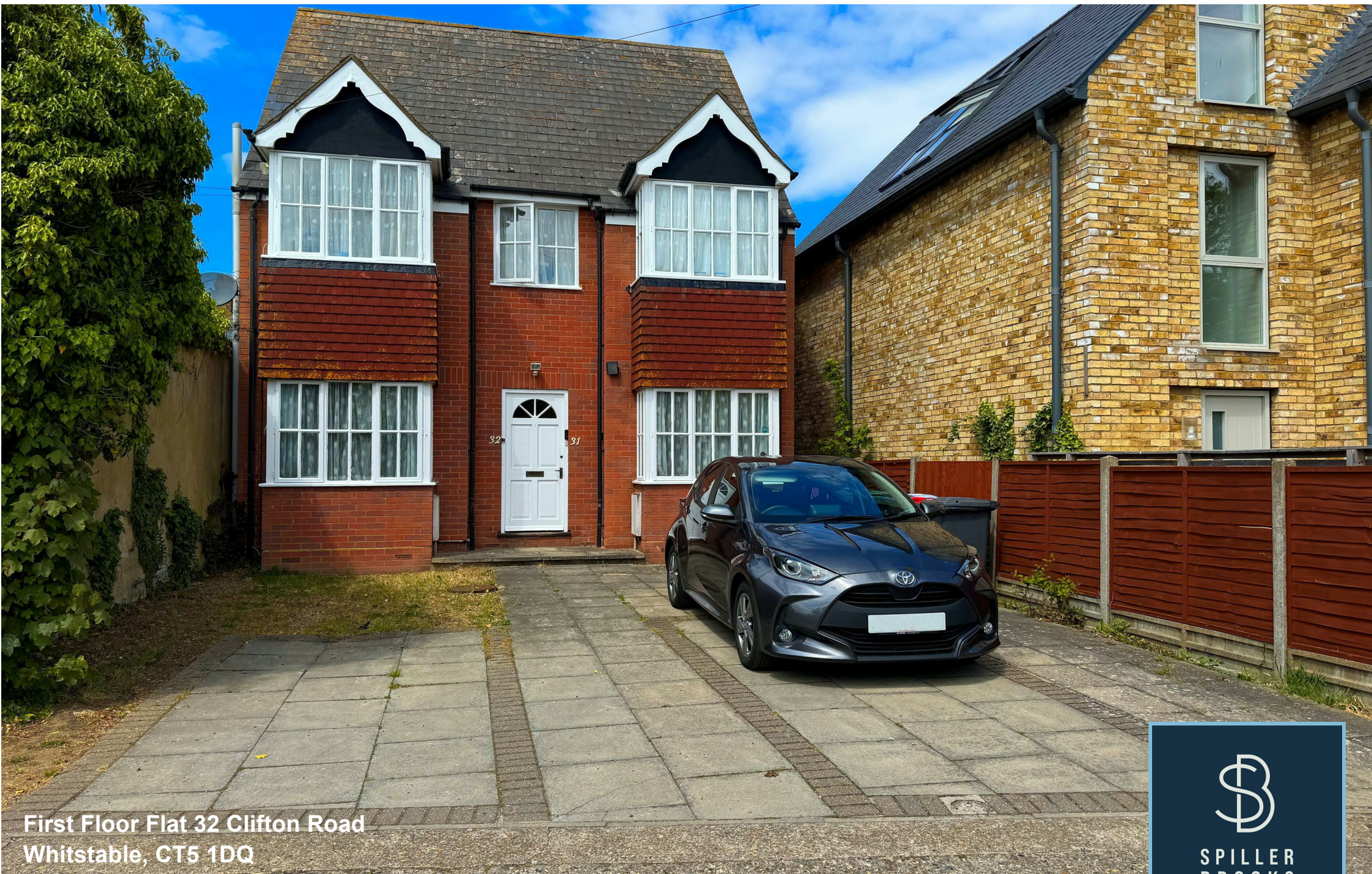
First Floor Flat 32 Clifton Road Whitstable, CT5 1DQ