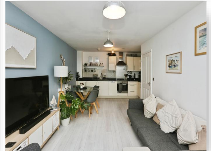
Ark Royal House Blanchard Avenue, Gosport PO13 8NR