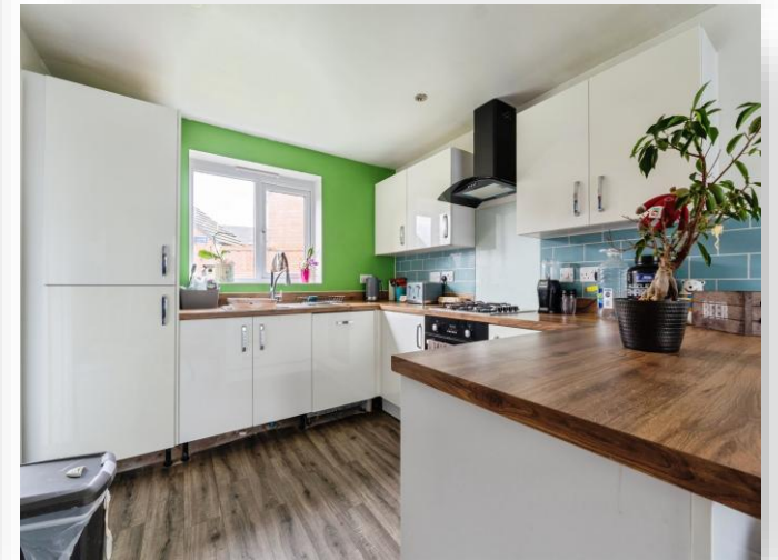
Starling Close, Shepshed