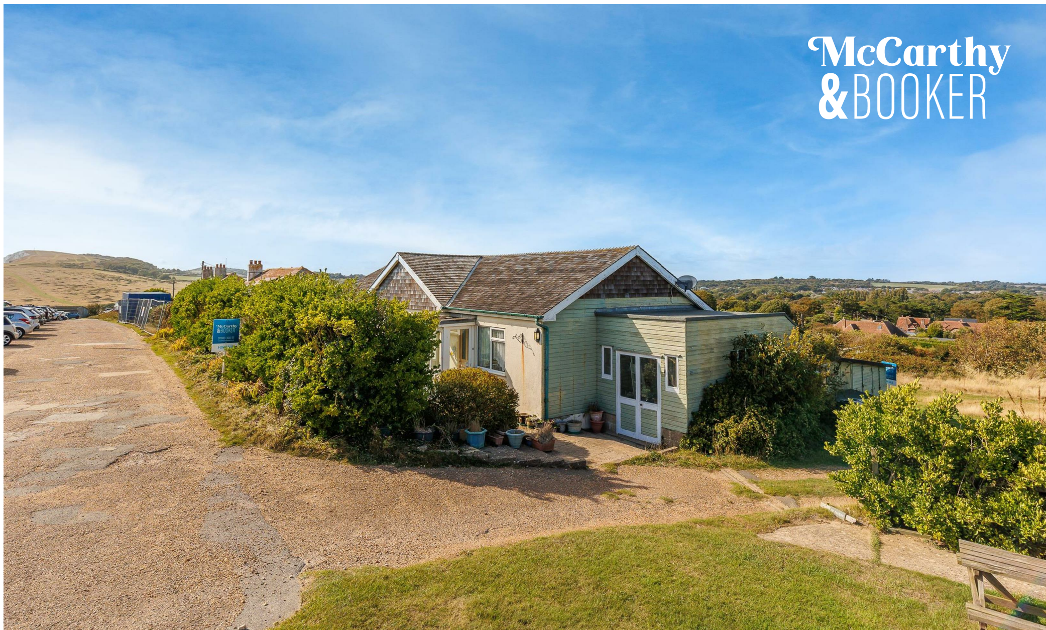
The Bungalow Afton Down, Freshwater, Isle of Wight, PO40 9TZ