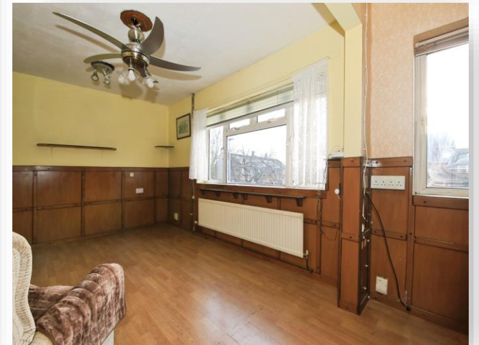
Furze Ride, Peterborough PE1 3UA