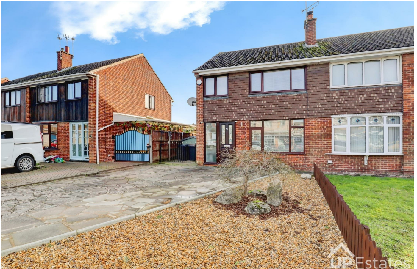
Kirkstone Road, Bedworth