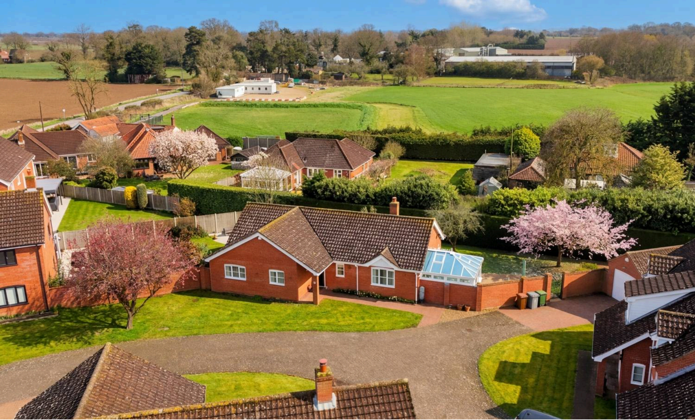
Oak Tree Close, Lingwood - NR13 4UH