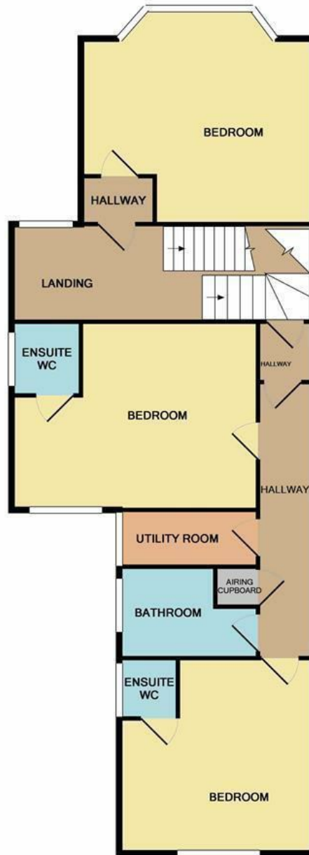
1ST FLOOR APPROX. FLOOR AREA 1090 SQ.FT. (101.2 SQ.M.)