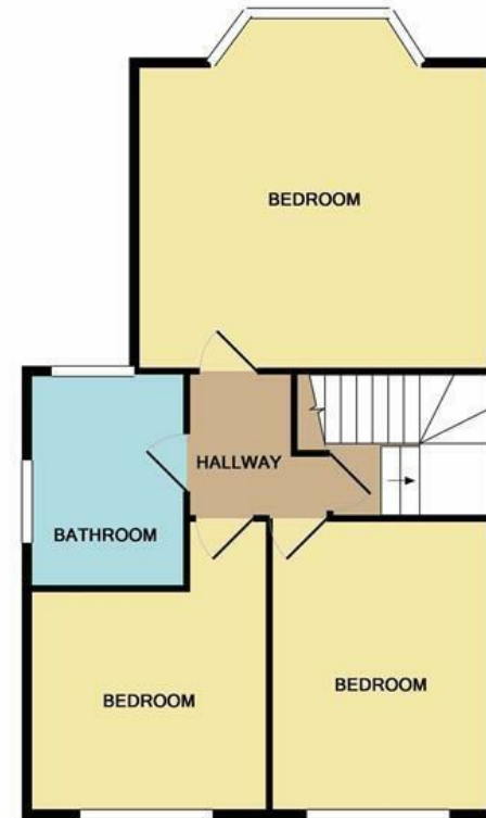
2ND FLOOR APPROX. FLOOR AREA 742 SQ.FT. (68.9 SQ.M.)

TOTAL APPROX. FLOOR AREA 2938 SQ.FT. (272.9 SQ.M.)