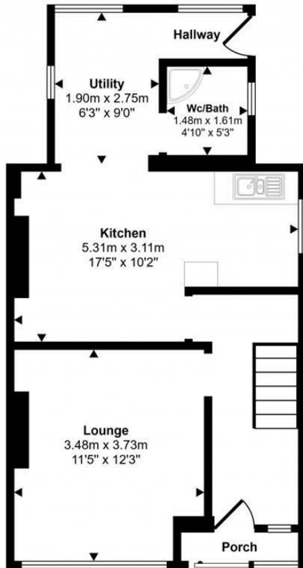
Ground Floor Approx 47 sq m / 503 sq ft