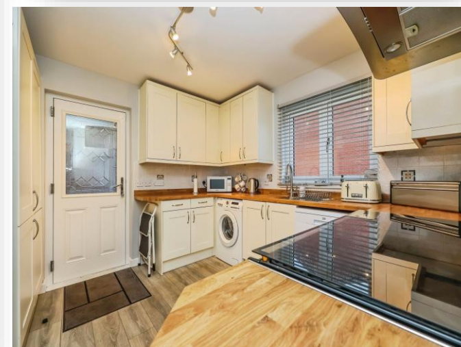
Wetherby Close, Kimberley Nottingham NG16 2TZ