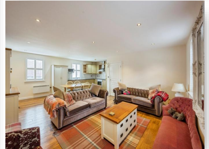
Castlegate Church Street, Conisbrough Doncaster DN12 3HP