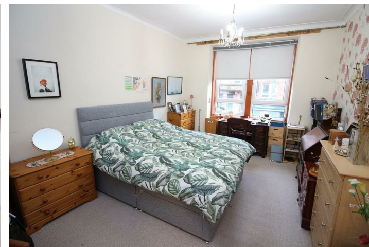
Bedroom 2 12'0" x 11'8" (3.67 x 3.56)