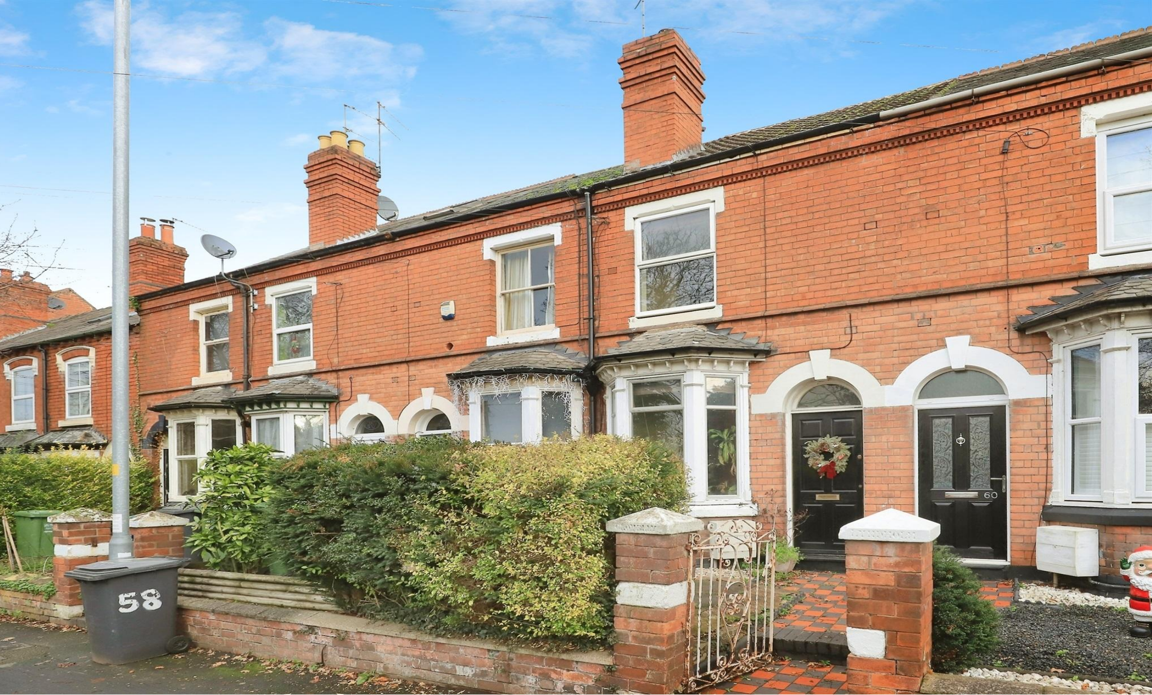
Woodfield Crescent, Kidderminster DY11 6TU