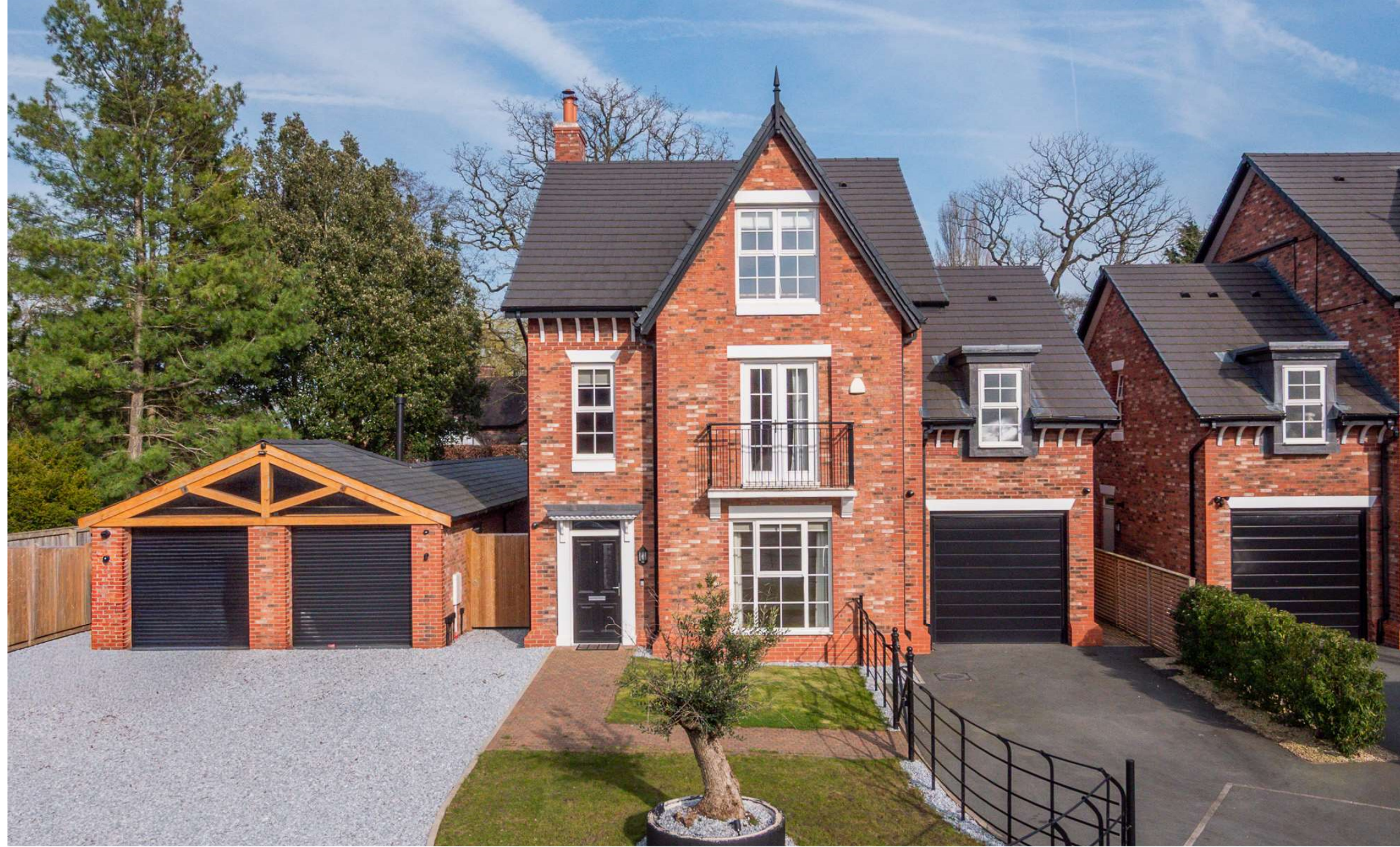
Lower Peover Ash Close