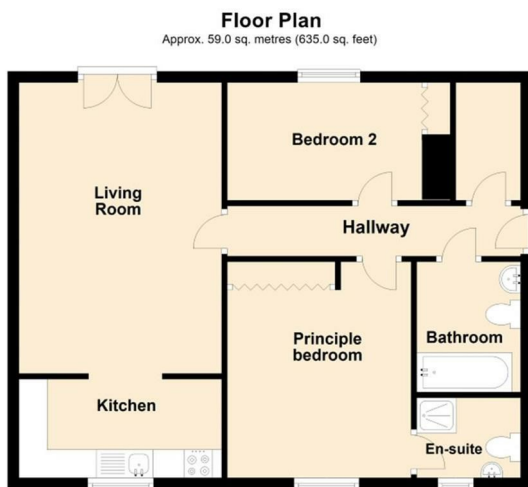
Total area: approx. 59.0 sq. metres (635.0 sq. feet)

Once you apply for a tenancy and pay a Holding Deposit you will be referenced. This process will include (but not be limited to) a check on your credit history, employment/income sources and current landlord. You will be sent a link by a reference provider. Please follow the link and provide the requested information. Once the reference report is complete this will be provided to the Landlord, and when we have their approval we will contact you to confirm a start date.