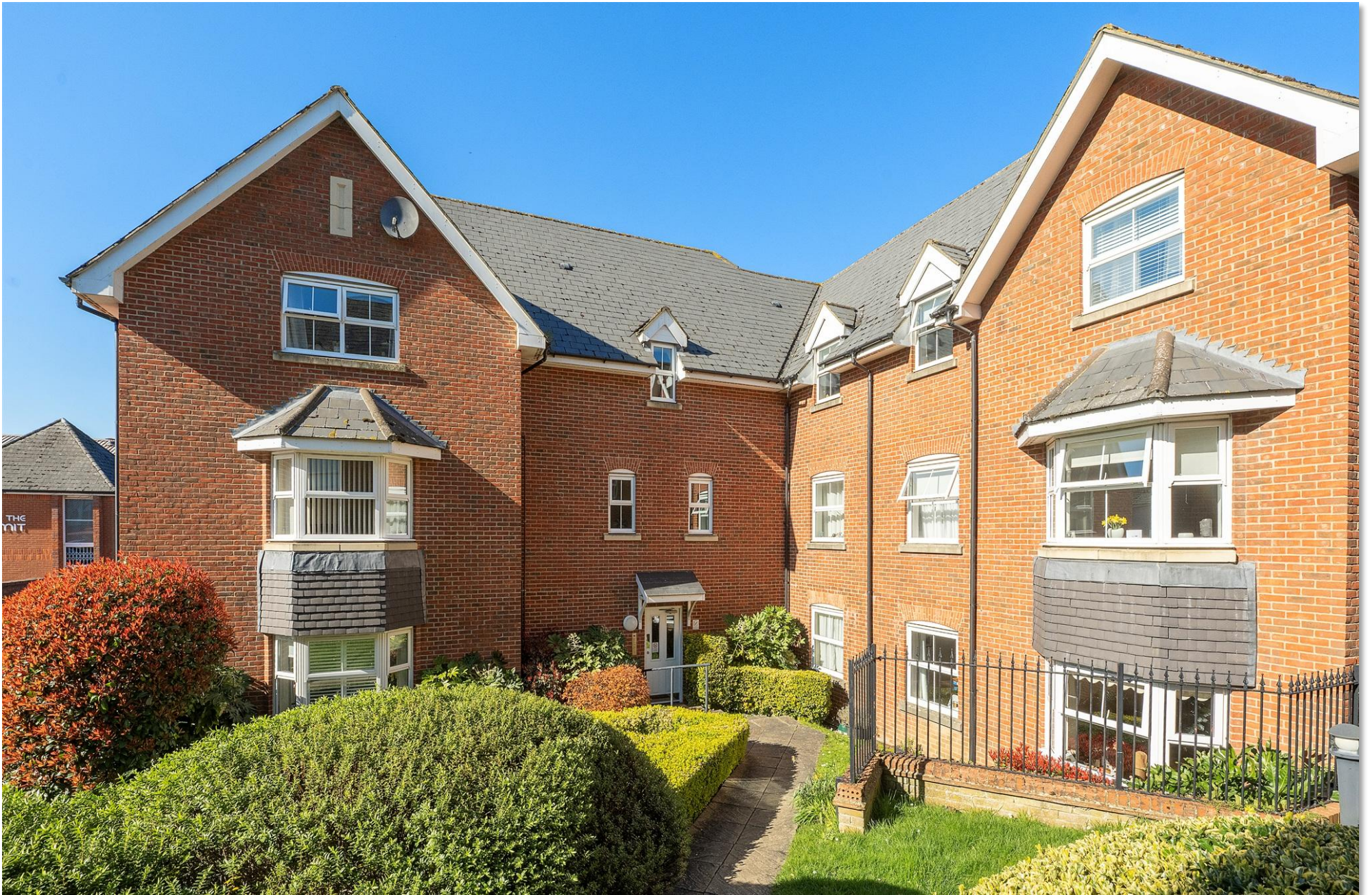
Pope Court Gowers Yard, Tring HP23 4FD