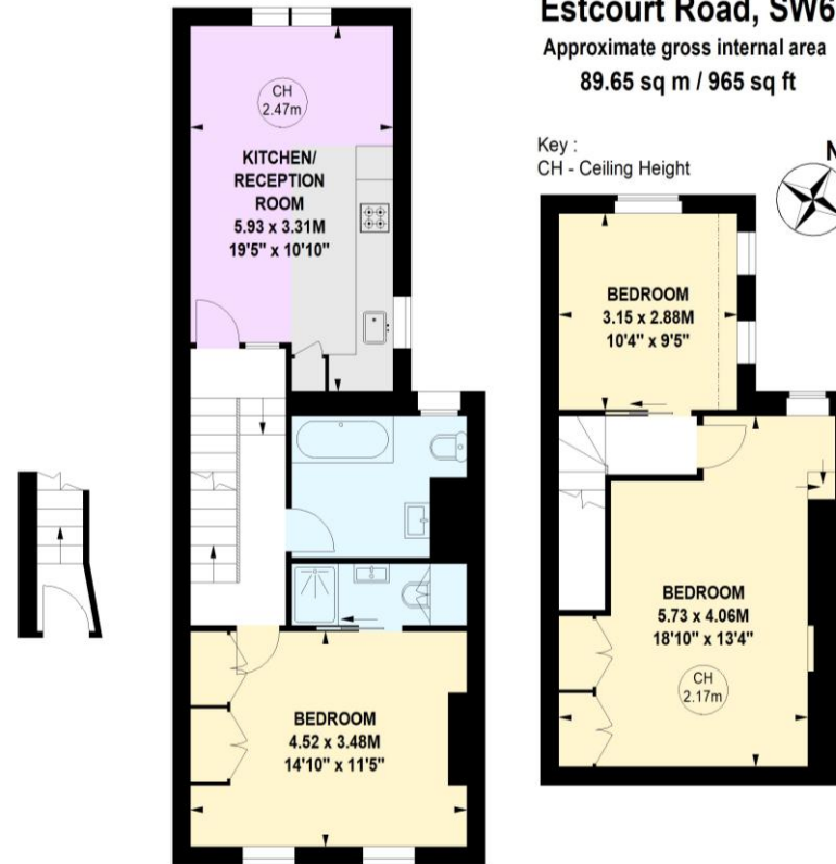
Ground Floor Entrance