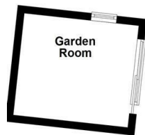
Ground Floor Approx. 58.3 sq. metres (628.0 sq. feet)