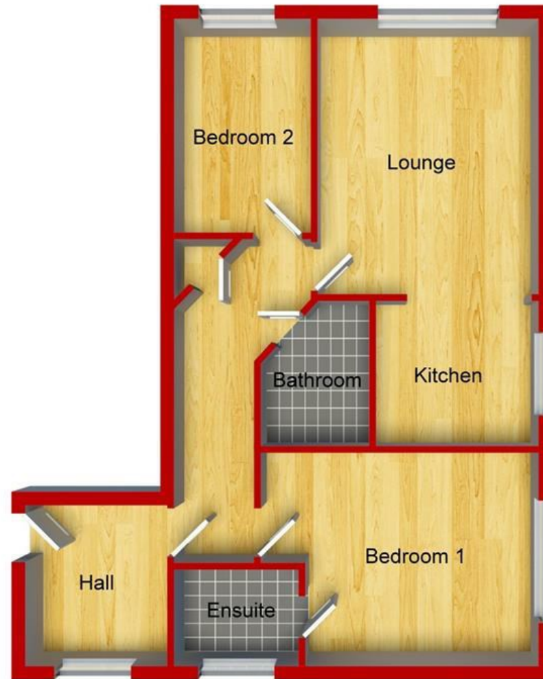
4 Swan House