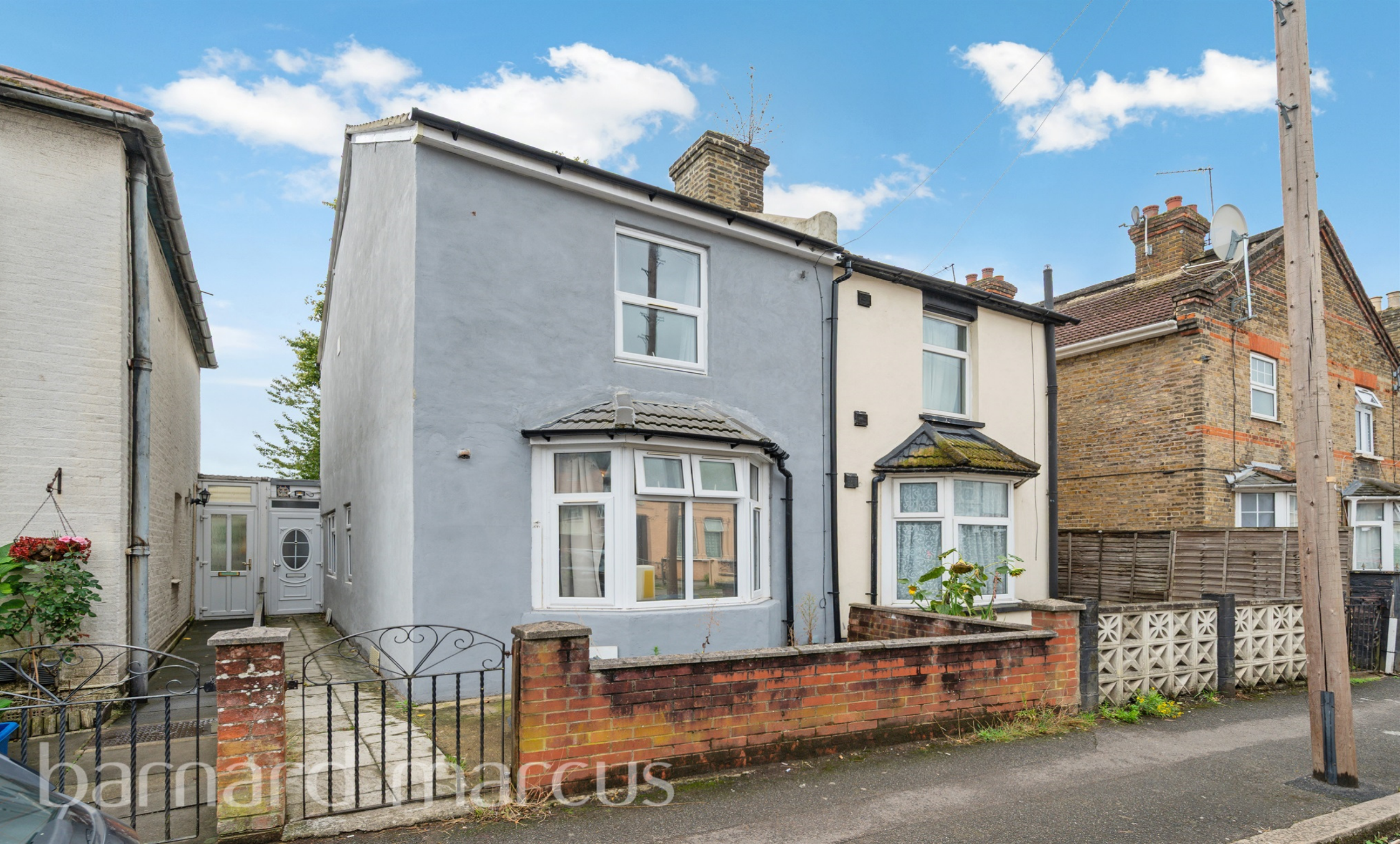
Grove Road, Hounslow TW3 3PT