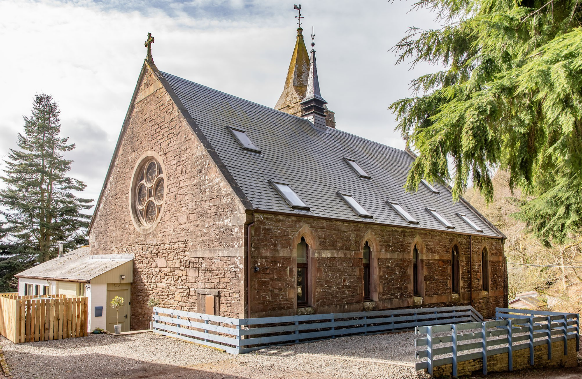
GILMERTON CHURCH HOUSE, HIGHLAND ROAD, GILMERTON, CRIEFF, PH7 3NA