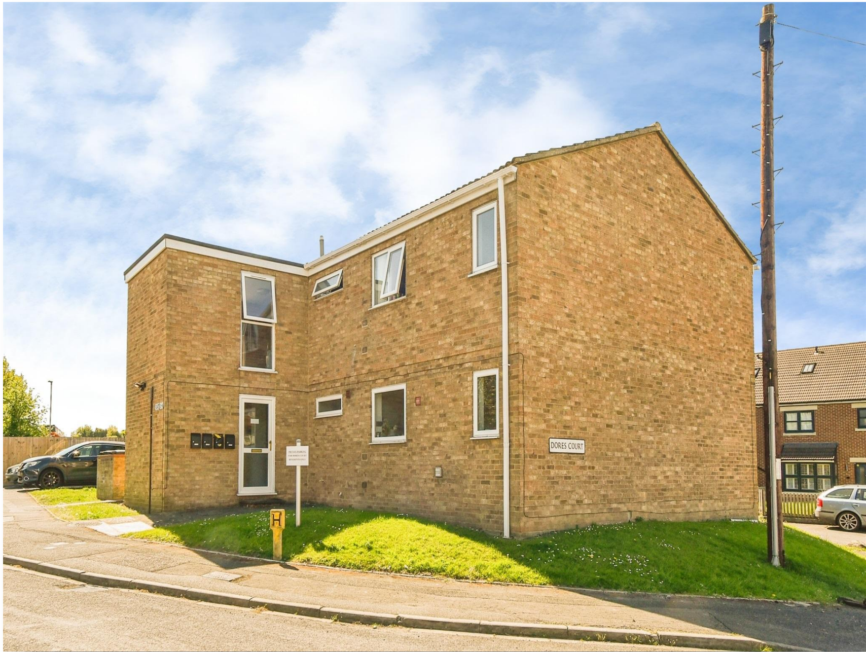
Dores Court, Swindon, SN2 7QY