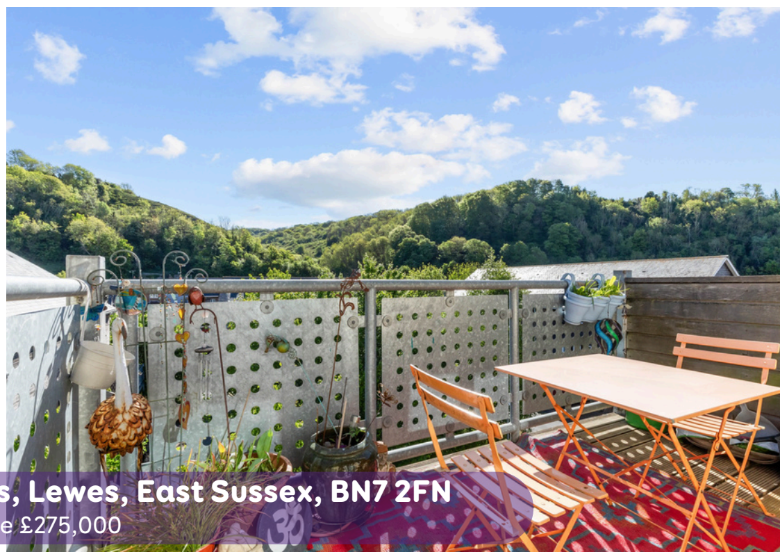
Clayhill Court, 20 The Nurseries, Lewes, East Sussex, BN7 2FN Asking Price £275,000