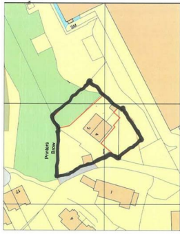
2 and 4 Printers Brow, Hollingworth, Hyde, SK14 8JU SCALE 1:500 @ A3