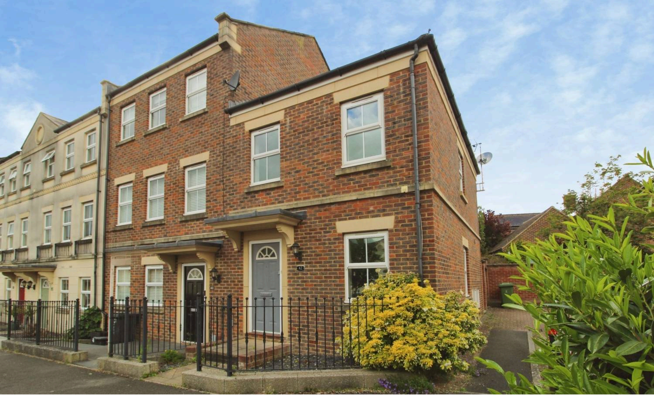
42 Dowland Close Swindon