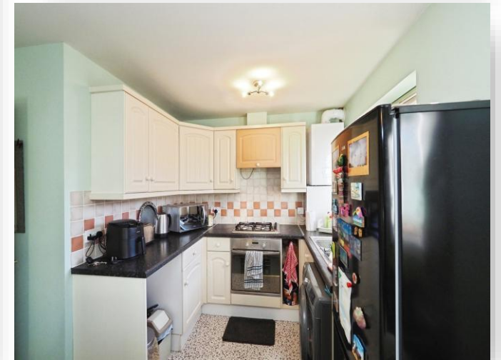
Cliff Avenue, Loughborough