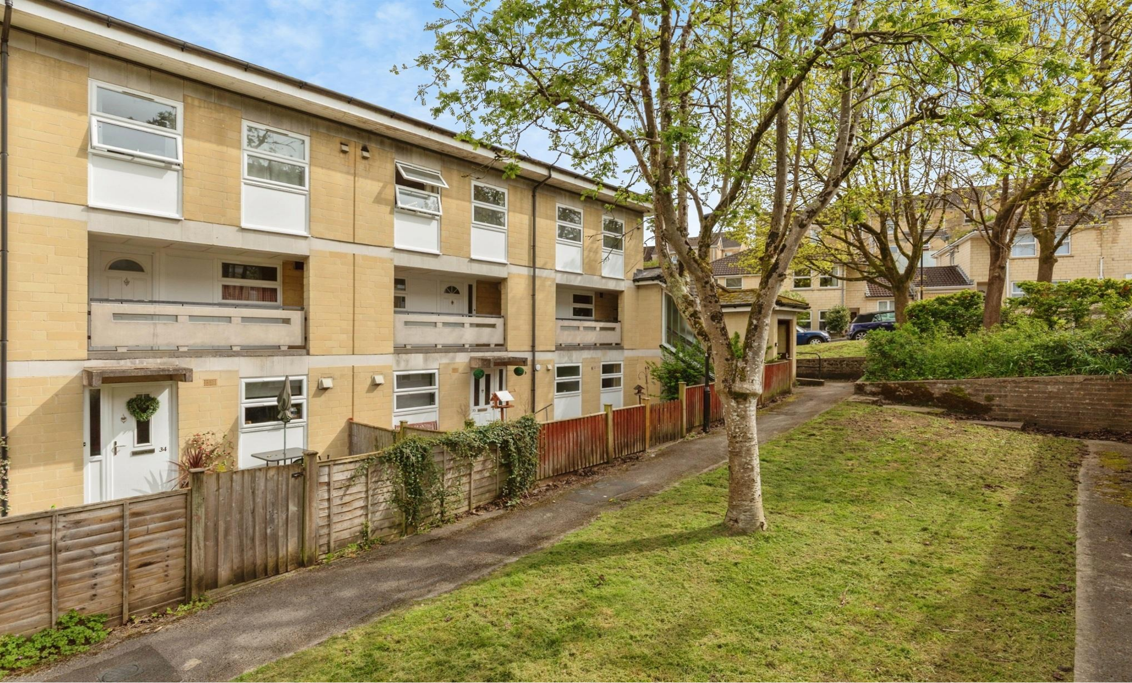
Midsummer Buildings, Bath, BA1 6JH