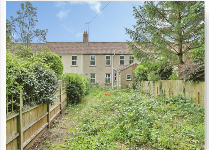
Hill Cottages, Whitlingham Lane, Trowse, Norwich, NR14 8UA