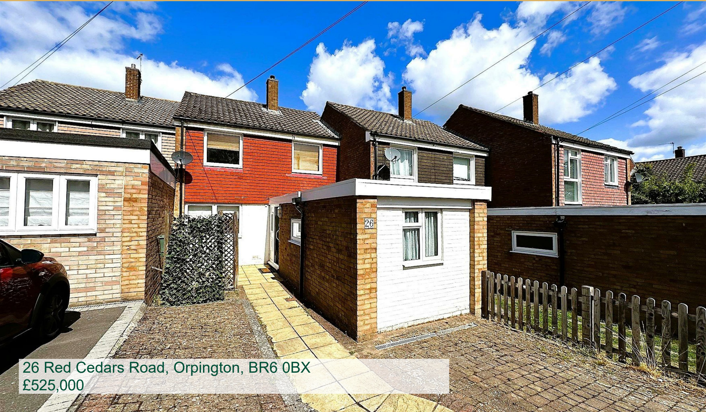
26 Red Cedars Road, Orpington, BR6 0BX £525,000