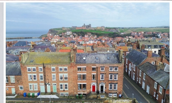
2 POPLAR ROW, WHITBY- 4 bed Town House -£259,950