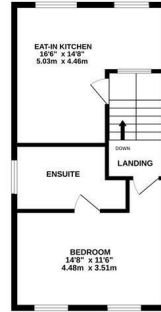
1ST FLOOR 442 sq.ft. (40.8 sq.m.) approx.