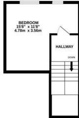
LOWER HALL FLOOR 266 sq.ft. (24.5 sq.m.) approx.