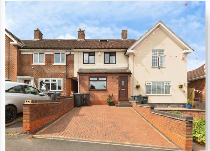
Ibberton Road, Birmingham B14 4SA