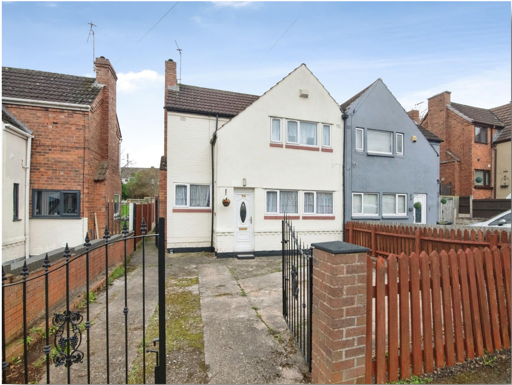
Hallchurch Road, Dudley DY2 0TH