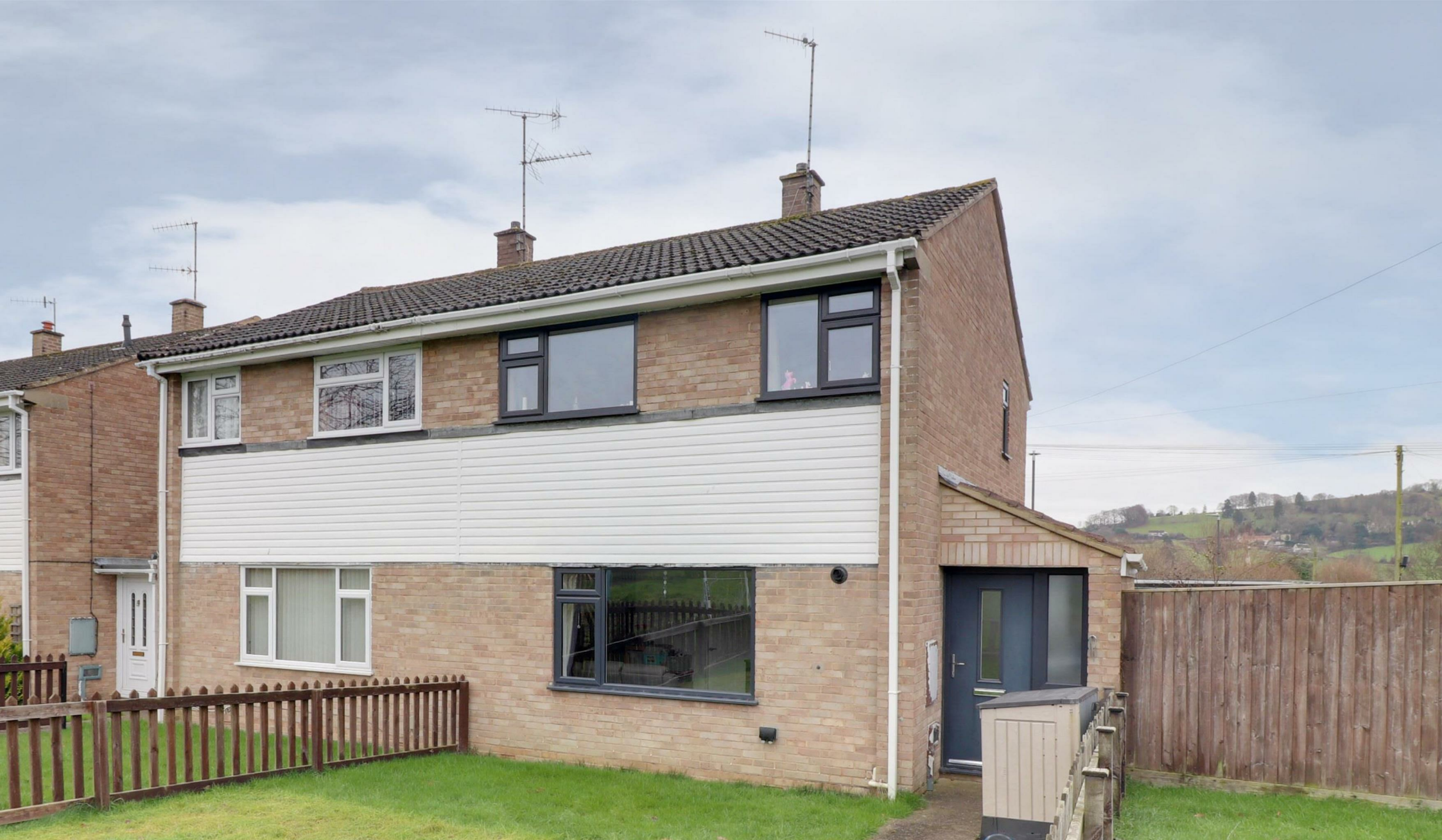
The Beagles, Cashes Green GL5 4SE £323,000