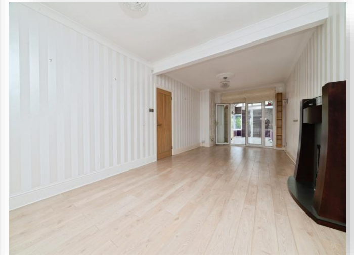
Carr Lane, Willerby HU10 6JX