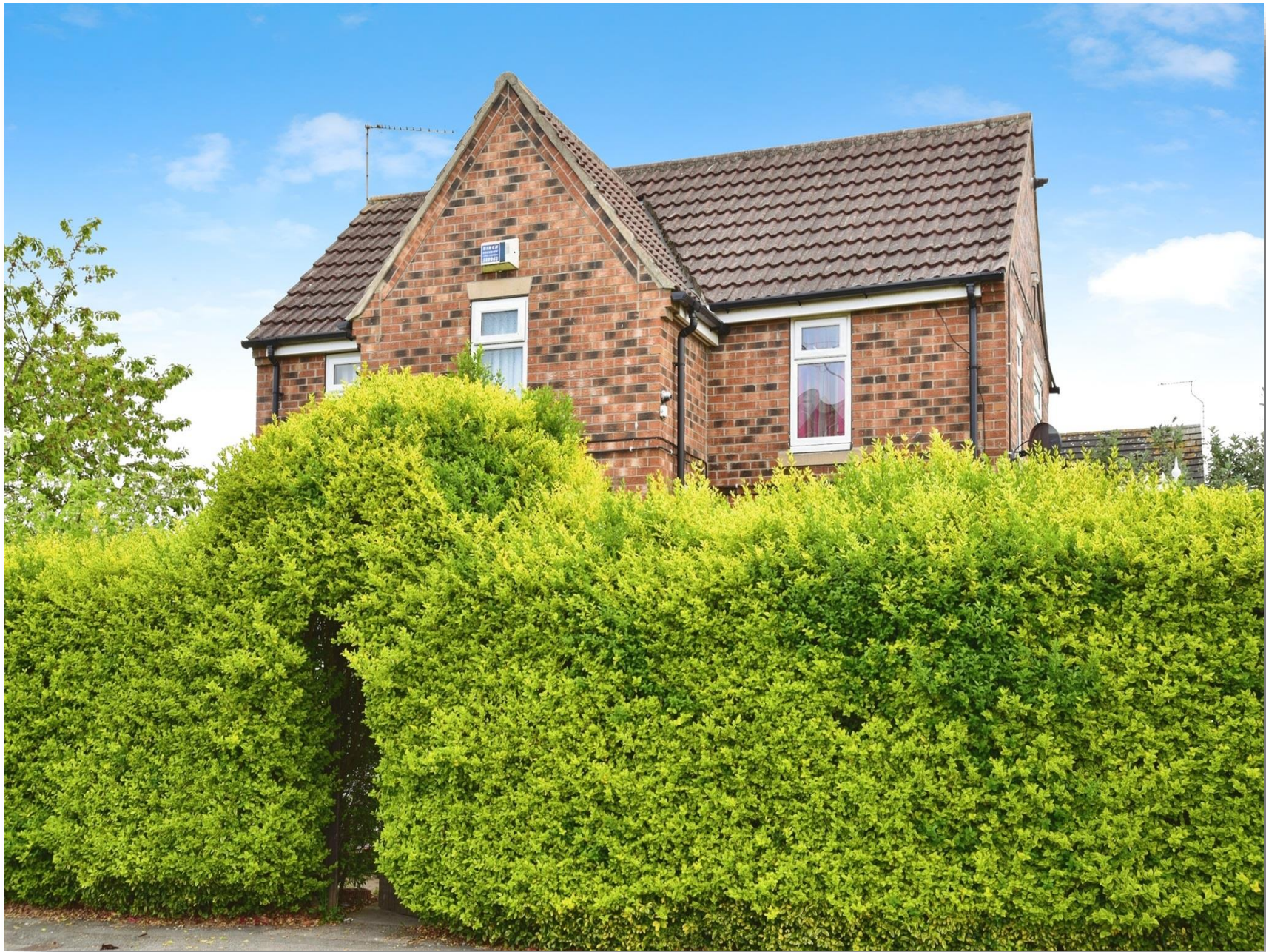
West Grove, HULL, HU4 6RQ