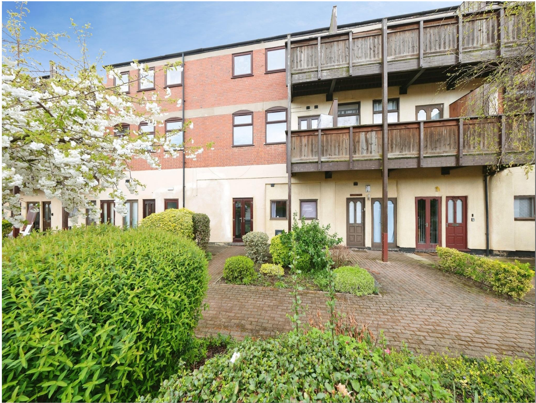
The Hamilton, Nottingham NG7 2JA