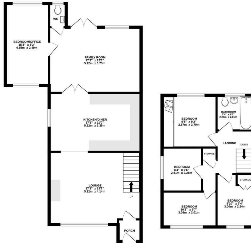
TOTAL FLOOR AREA : 1202 sq.ft. (111.6 sq.m.) approx. Measurements are approximate. Not to scale. Illustrative purposes only Made with Metropix ©2026