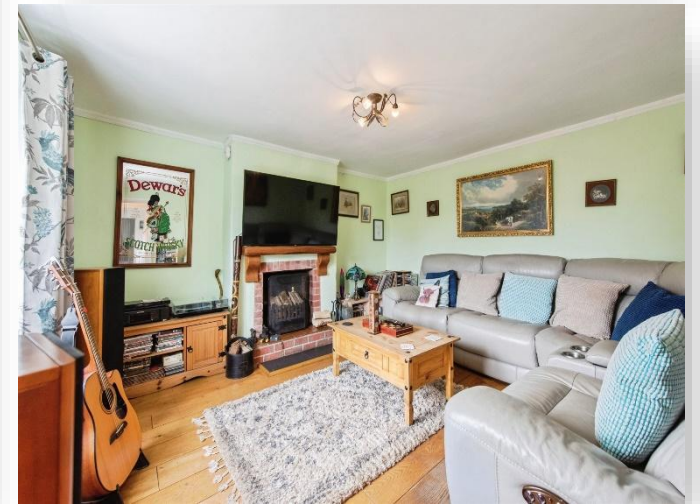
Church Lane, Northwold, IP26 5LY