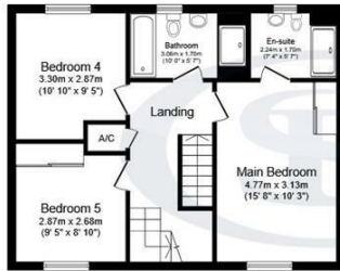
First Floor Floor area 54.2 sq.m. (583 sq.ft.)