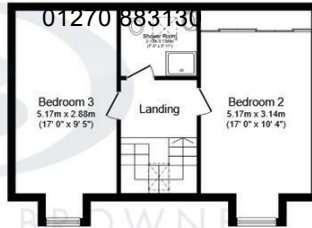
Second Floor Floor area 44.8 sq.m. (482 sq.ft.)