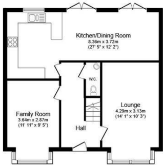
Ground Floor Floor area 65.1 sq.m. (701 sq.ft.)