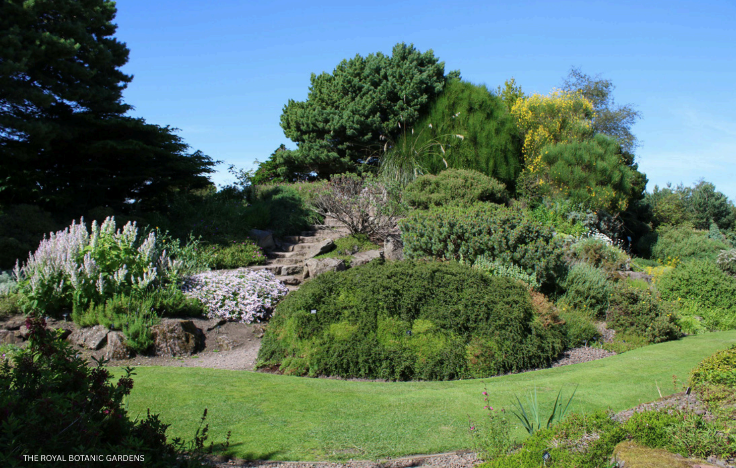
THE ROYAL BOTANIC GARDENS