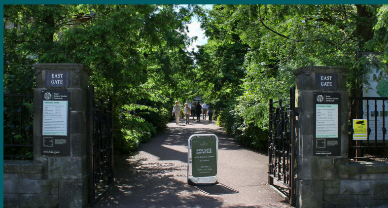
THE ROYAL BOTANIC GARDENS EAST GATE ENTRANCE A STONE'S THROW FROM FLAT

The property benefits from exceptional public transport links, including regular bus services to the city centre, and nearby Ferry Road offers quick access to the A90, linking to the major road networks.