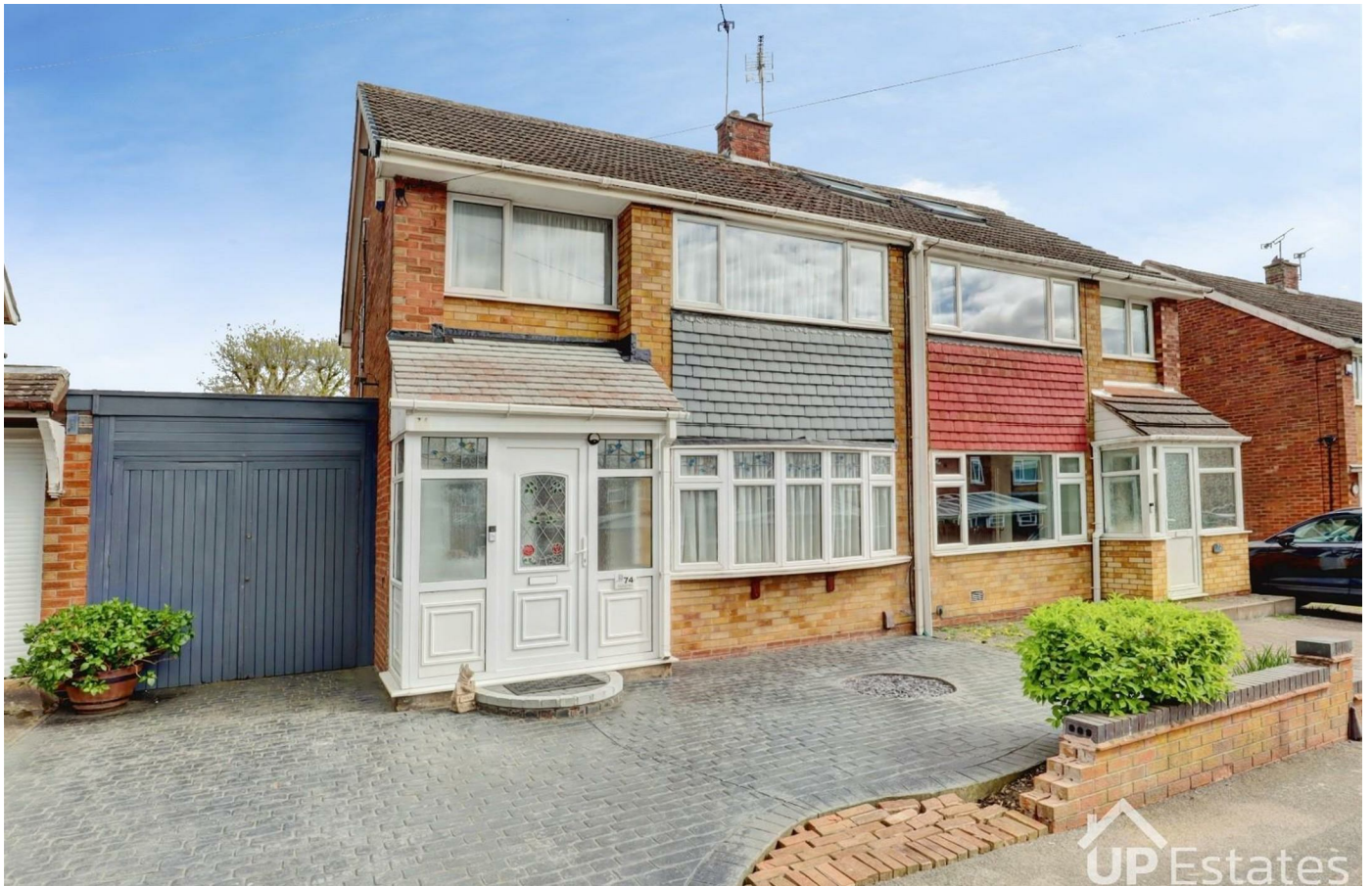
Frilsham Way, Allesley Park, Coventry