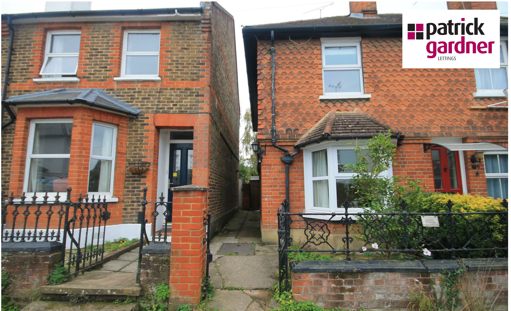
Byron Place, Leatherhead, KT22 8AX